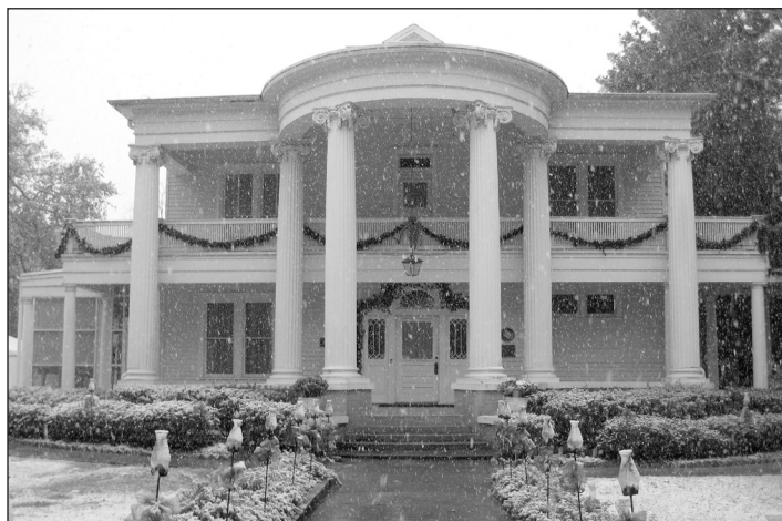
A thick blanket of snow kicked off the annual Candlelight Tours last year. Start the Christmas season by joining us this Friday and Saturday (December 3 & 4) for "Christmas Around the World" at the 1883 John M. Moore home!

New this year will be a Christmas craft corner for children. Cookies and was-sail will be served on the